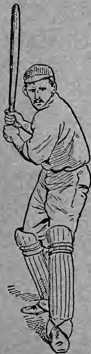
THE BEGINNING OF THE LEG HIT, SPOILED BY THE LEFT FOOT BEING TOO STRAIGHT AND THE RIGHT KNEE BENT.

left foot to mid-on is an important maneuver in leg-hitting. It gives ease to the bringing round of the right shoulder, and prevents that uneasy